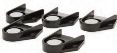
HI920005 Tag holders with tags (5)