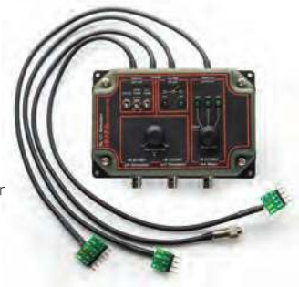
BL120-901 Simulator for BL121