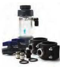
BL120-463 Flow-cell kit for 63 mm pipe diameter