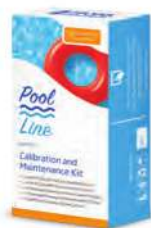
BL123-70 Calibration and Maintenance Kit 1 x pH 7.01 buffer solution sachet (20 mL) 1 x pH 4.01 buffer solution sachet (20 mL) 1 x electrode cleaning solution sachet (20 mL) 1 x electrode storage solution sachet (20 mL) 1 x ORP test solution sachet (20 mL)