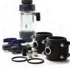
BL120-475 Flow-cell kit for 75 mm pipe diameter