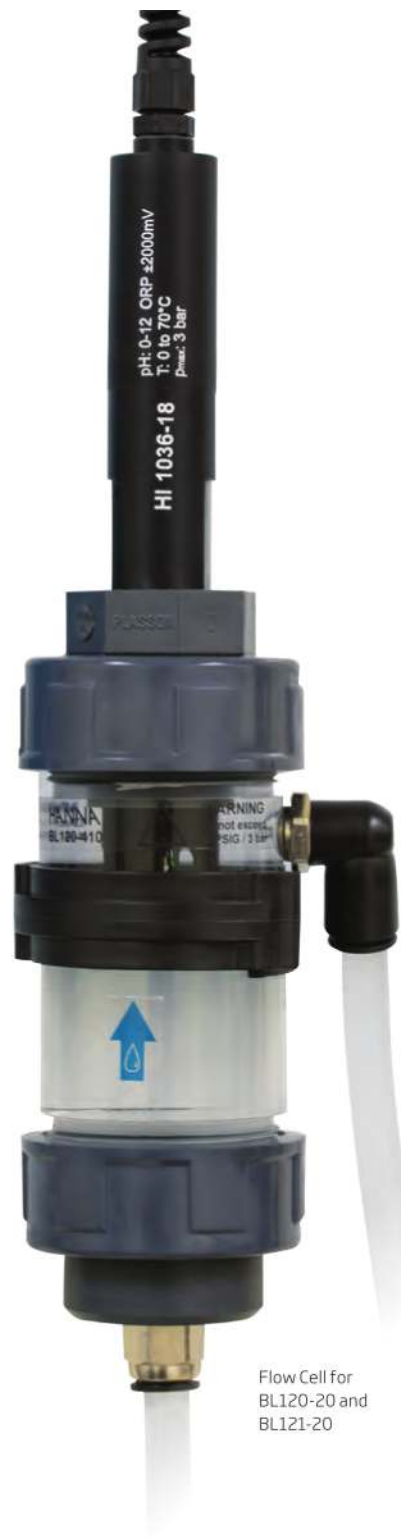
Flow Cell for BL120-20 and BL121-20

BL120 and BL121 controllers feature a password protection solution that offers restricted access to calibration, setup, and review of logged data. The password can be set and enabled/disabled during general setup of the instrument.