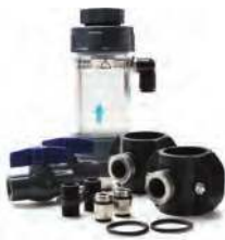
BL120-450 Flow-cell kit for 50 mm pipe diameter