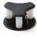
BL120-301 Pool controller peristaltic pump rotor