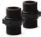
BL120-601 Plastic nipple 2 x 1/2" with O-rings