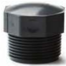
BL120-501 Protective saddle cap, 1 - 1/4" thread