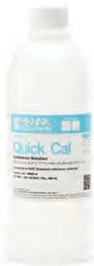
HI9828-25 Quick Calibration solution