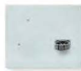
BL100-421 Flow cell panel