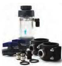
BL120-463 Flow-cell kit for 63 mm pipe diameter