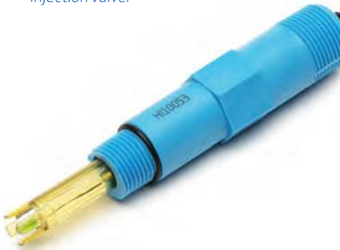
HI10053 Amplified pH/Temperature Probe

The BL100 is available in multiple configurations including a meter and probe option, a kit for in-line mounting, and a complete package that includes bypass loop and panel mounted flow cell. The kit for in-line and flow cell models include aspiration tubing with filter and dispensing tubing with injection valve.