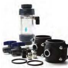
BL120-475 Flow-cell kit for 75 mm pipe diameter