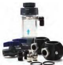
BL120-450 Flow-cell kit for 50 mm pipe diameter